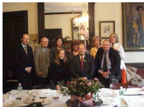
Group photo from the meeting