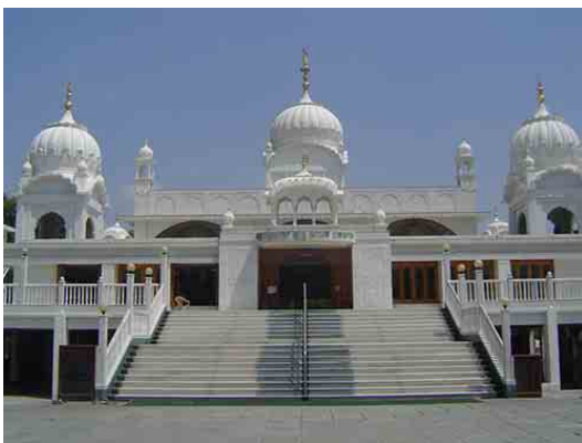
The Guru Nanak Darbar (a Sikh palace in Pune)